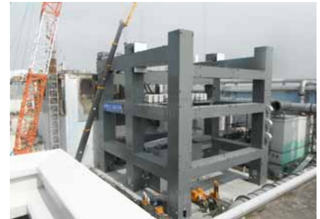
(3) Completion of the third layer of the steel framing (March 13, 2013)