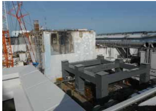
(2) Completion of the first layer of the steel framing (January 14, 2013)