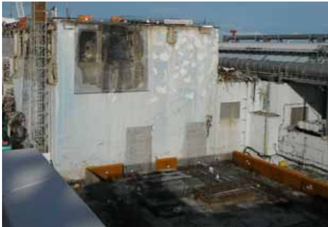
(1) Before the steel frame construction was started (December 18, 2012)