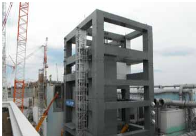
(4) Completion of the steel frame construction excluding the upper part of the Reactor Building (April 10, 2013)