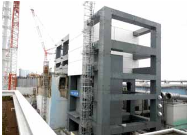
(5) Completion of the steel frame construction (May 29, 2013)